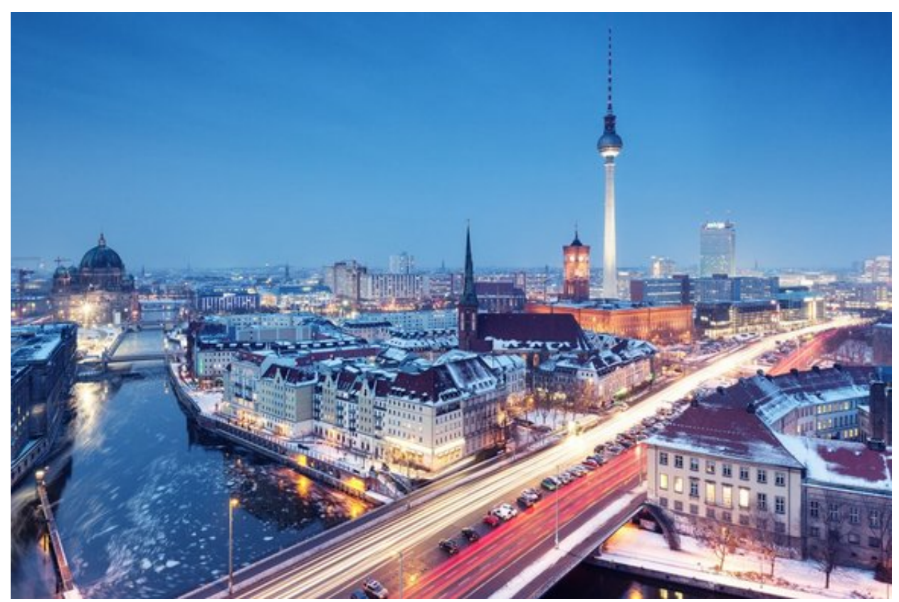
Berlin, home to Silicon Allee, is threatening London's place as Europe's tech hub

The Sunday Times Published: 23 March 2014